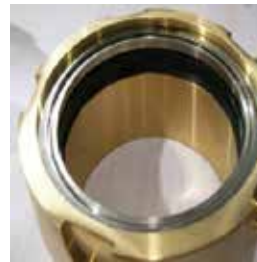
Custom Engineered Metallic Scraper