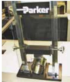
High Strength Micro-Alloy Steel

A combination of technologies designed to provide extended service life in the toughest of environments.