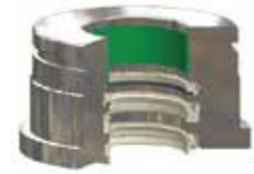
Parker Sealing Technology

* Results from 1000 hour exposure to Calcium Chloride